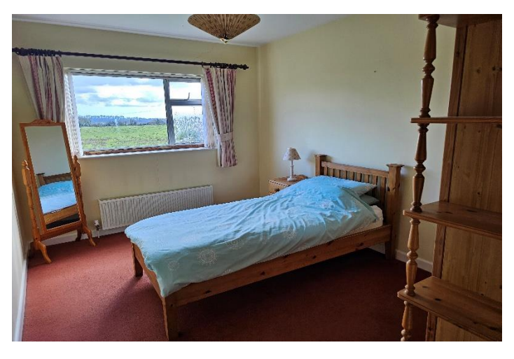
Bedroom Four 12' 0" x 6' 11" (3.65m x 2.10m) Front aspect window with view over the front garden. Loft access hatch. Radiator.