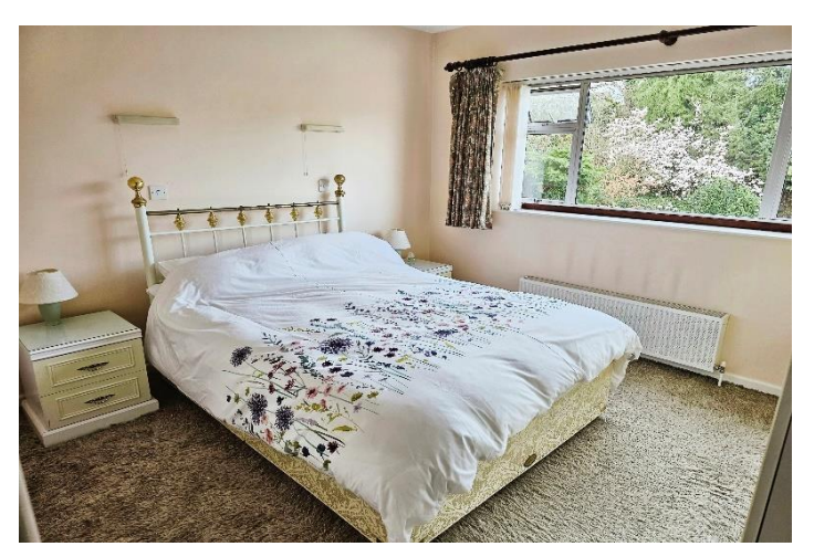
Bedroom Three 13' 0" x 9' 4" (3.96m x 2.84m) Rear aspect window with view over the garden and countryside beyond. Radiator.

Front aspect window with view over the front garden. Television point. Wall lights. Radiator.